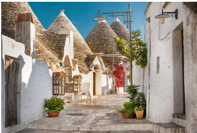
Trulli Houses, Alberobello

Masseria Petrarolo www.masseriapetrarolo.com (6 nights)