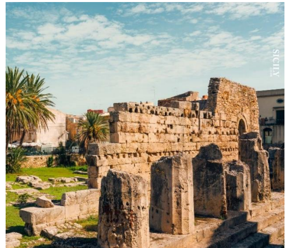
Temple of Apollo