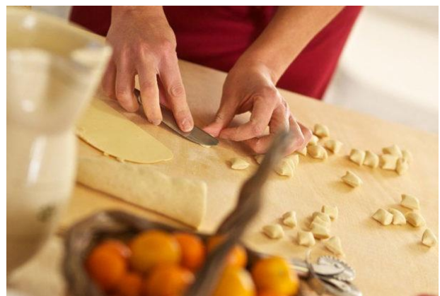
Cooking Class & Dinner