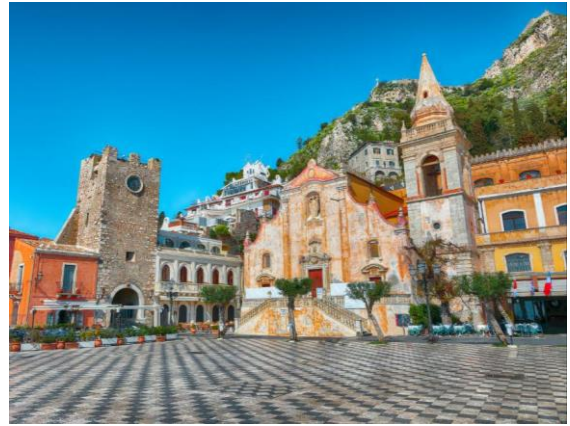
Piazza IX Aprile