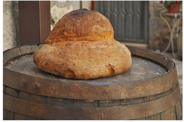
Bread of Altamura