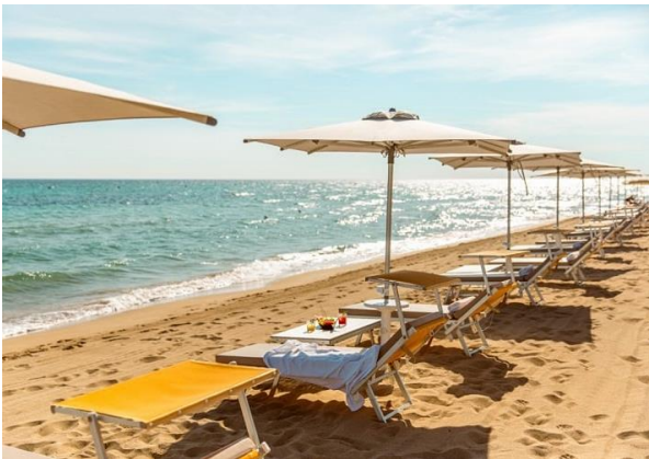
Beach Club on the Adriatic Sea

Today, enjoy a full day guided experience visiting the Sassi di Matera, having a picnic lunch, and sampling the bread of Altamura. The Sassi cave dwellings are prehistoric shelters believed to be among the first human settlements in Italy, and are considered one of the most unique landscapes in Europe. Matera is the only place in the world where people can boast to be still living in the same houses of their ancestors of 9,000 years ago! Continue on to nearby Altamura to sample the famous bread made since Roman times. In 37 BC, a Roman poet hailed the bread as the best he had ever eaten. For centuries, it was the main staple and each family prepared a large dough of bread at home and then took it to the public oven to cook with other loaves made by families from the village, with each loaf engraved with the family's name. Enjoy a picnic lunch along the way that includes bread of Altamura. In the evening, after your chef-prepared dinner in the formal dining room, retreat to the comfort of the Masseria's living room to play a suspenseful Murder Mystery Game where everyone has a part to play! (B, L, D)