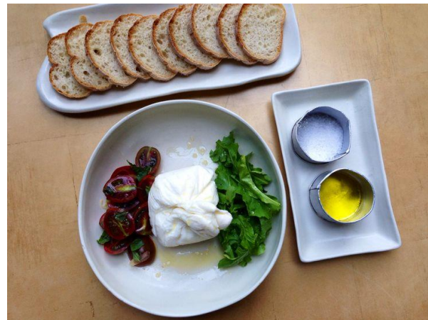
Burrata Cheese Tasting