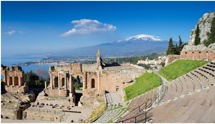
Ancient Greek Theater