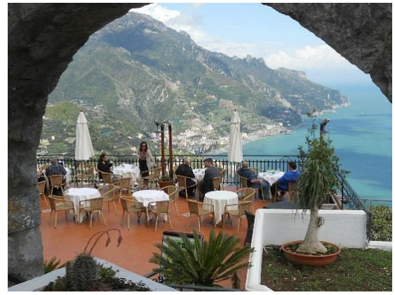
Ristorante Garden, Ravello