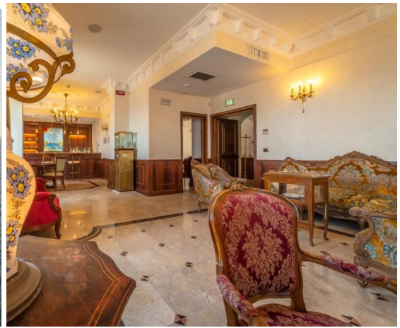
Livingston Hotel Lobby Bar