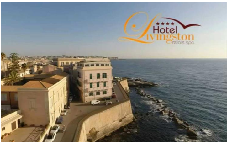
Livingston Hotel, Ortigia