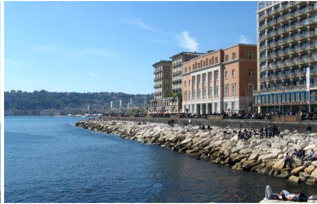
Naples Harbor Promenade