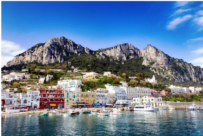
Island of Capri

Today, enjoy a full-day guided walking/driving tour of the Amalfi Coast, beginning at your hotel in Praiano. Traveling south on the coastal road, visit hill and harbor-hugging towns and historic ruins. Enjoy lunch at Ristorante Garden, a hillside-clinging restaurant in Ravello with incredible views of the coastline below and delicious homemade pasta. Ravello sits at 1,200 feet above sea level on a long, flat promontory jutting out of the mountains. The grand villas and palazzos, now home to luxury hotels, were once the residences of wealthy merchants who built the remarkable churches that dot the town. After lunch, drive to the nearby village of Minori to visit an ancient Roman villa dating from the 1 st century BC, believed to have been the seaside residence of a Roman senator. Return to the hotel in the late afternoon to enjoy the rest of the day at your leisure. (B, L)