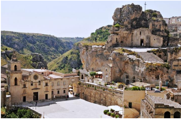
Sassi of Matera