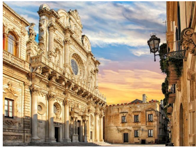
Baroque Architecture, Lecce