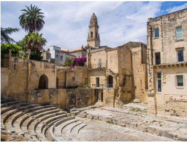
Ancient Roman Theater, Lecce