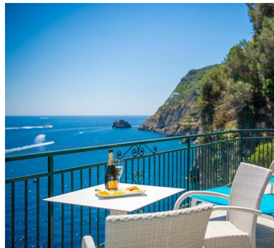
View from Villa Maria Pia