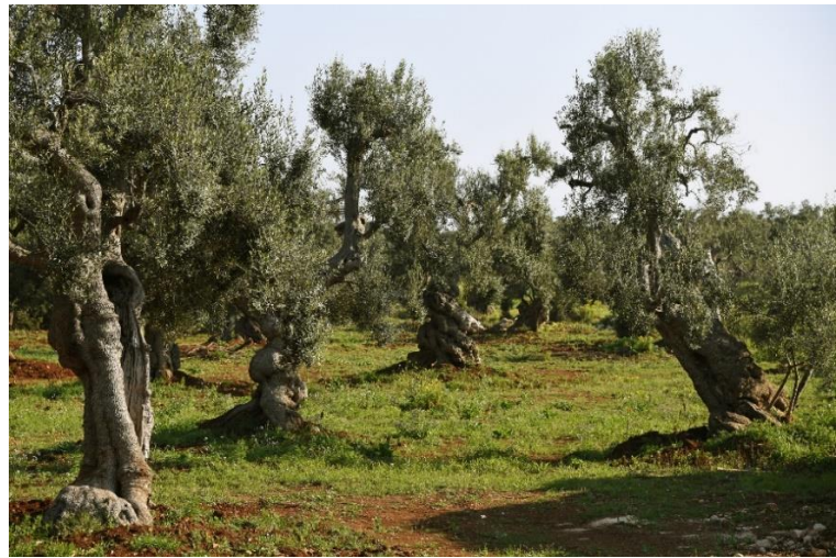
Ancient Olive Grove, Puglia